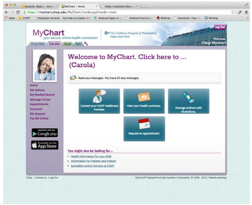
Figure 2: MyChart screenshot which shows link to MyAsthma tool

5. A provider data entry form will be developed in EPICCare which will streamline and standardize the data collection. CHOP recently developed a similar Smartform which enables "point and click" provider data entry for patients with Inflammatory Bowel Disease as part of a multi-site Gastroenterology Registry. See below in Figure 3: